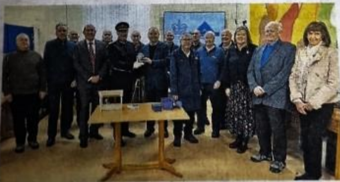
The Men's Shed is honoured for its work.

"This will inspire us to continue to contribute to the welfare of Stonehaven and its residents."