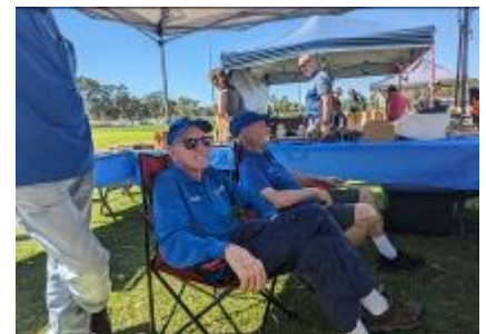
Two old marketeers hard at work.