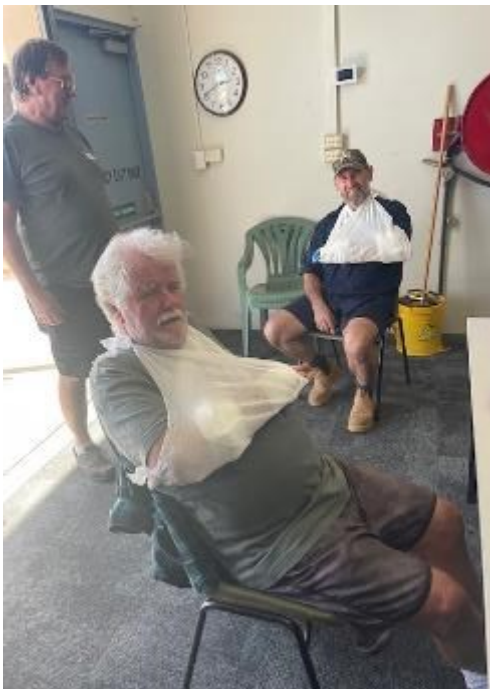
Had these two blokes been fighting?

A first aid course was organised on Thursday 10th October which was attended by several members.