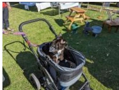
How did that cat get in to the show.