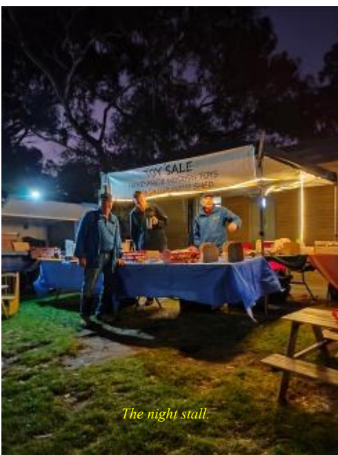
The night stall.