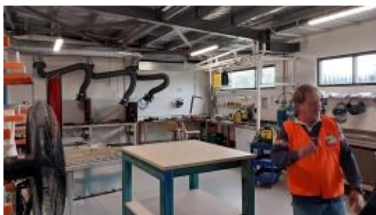
The metal work room