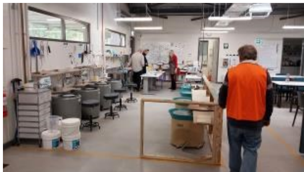
The shed has a pottery section. Picture shows eight pottery wheels.