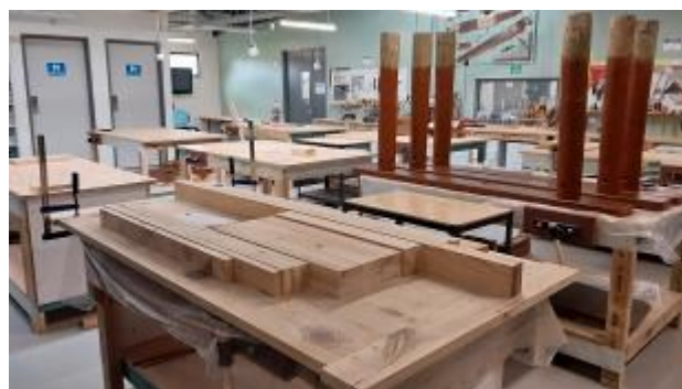
The assembly room. Note the absence of clutter.