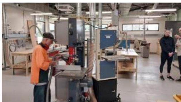
Three band saws in the machinery room.