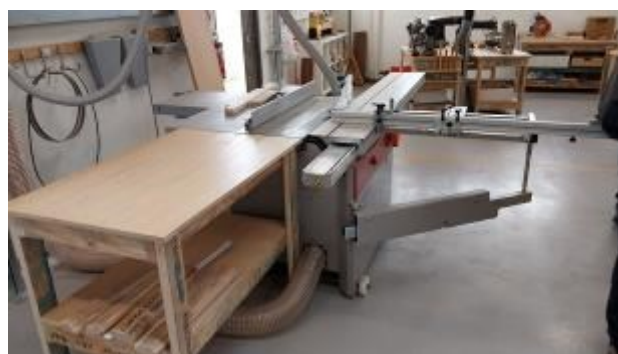
The panel saw