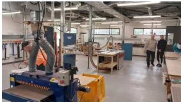
The machinery room.