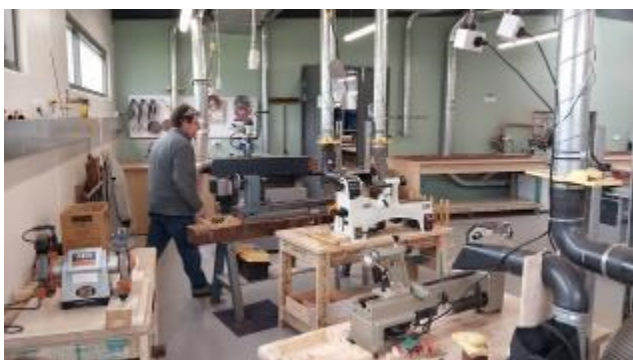
There are five lathes in the wood turning section