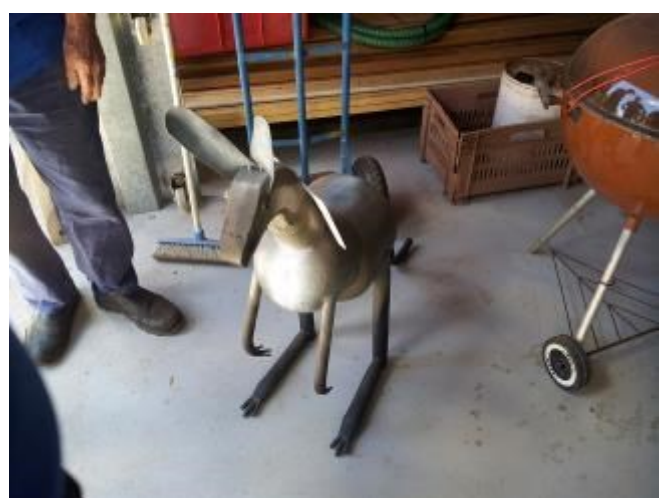
A work of art in the metal shop. A kangaroo made from a gas bottle.