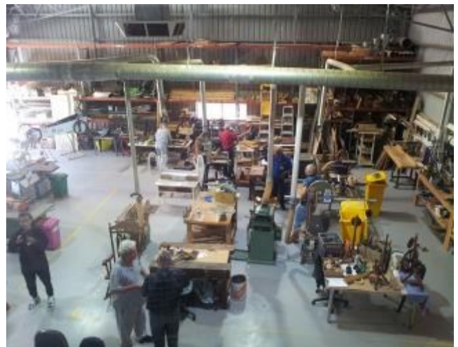
The view of the workshop from the social room