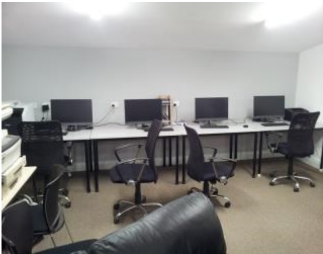
The computer section