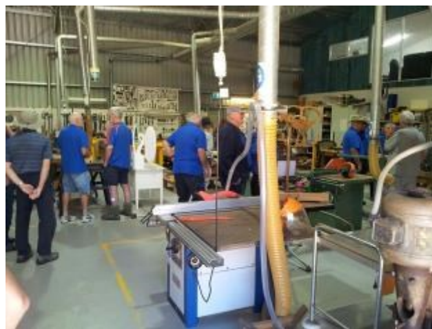
Members enjoying a tour of the workshop. The picture on the left shows the window of the social room on the mezzanine.