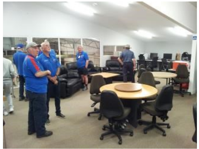
Two views of the social room showing the windows which overlook the workshop