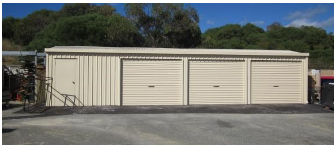
End of November, completed.