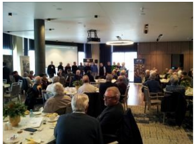
The long lunch in the RAAF Club