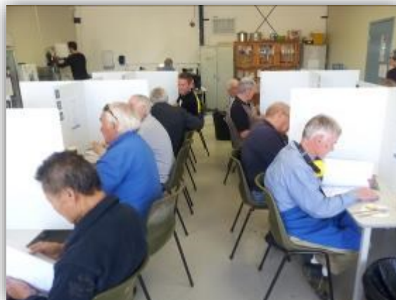
Members taking part in the taste test