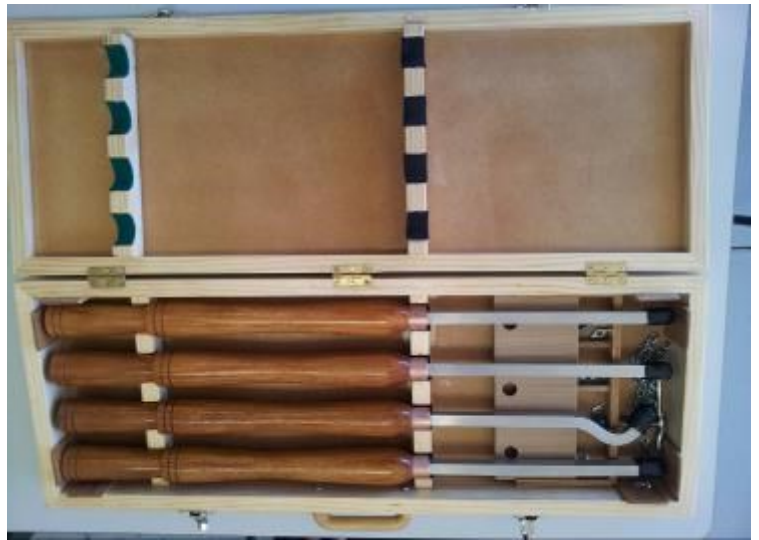
Pictured left: Vince with the lathe tools. Above the tools complete in their box