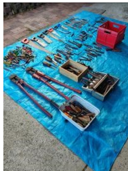
Rob's display of the collection of some of the tools for sale.

The advertisement on Facebook market place read Pre loved tools from the Joondalup Men's shed surplus to our requirements from $1 all donations to the shed. I had over 1500 views with many messages to reply to. I think it gave us a lot of exposure with many inquiries about the shed and raised $125