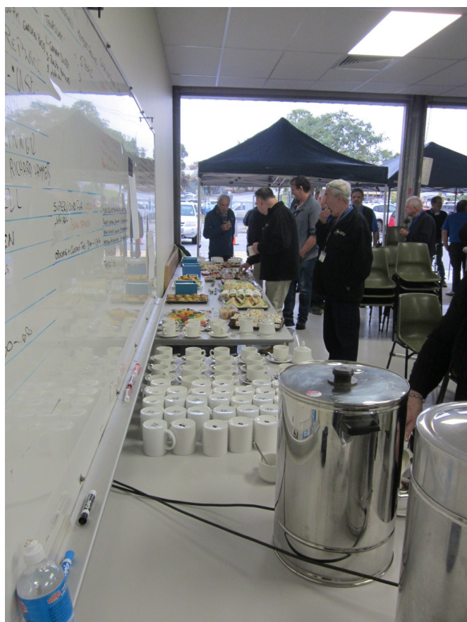
The delicious morning tea set out ready to be consumed