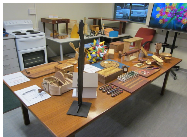
Articles made by shedders on display in the Committee room