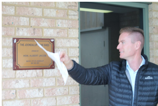
Unveiling the plaque