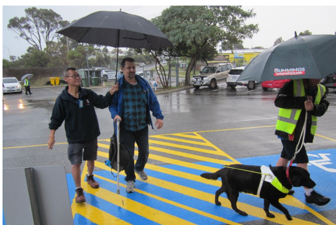
Guests arriving and so did the rain