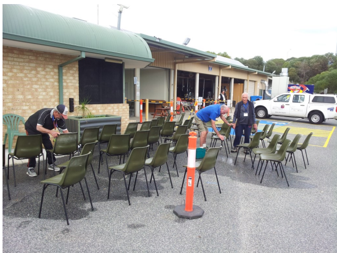
The day before the event preparing the chairs

The food from the Golden Bakery was first class and enjoyed by all. A lot of contacts were made and should be beneficial to the shed.