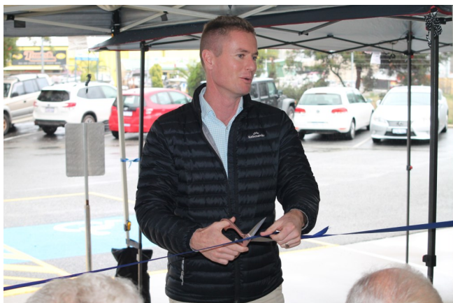
The Mayor cutting the ribbon