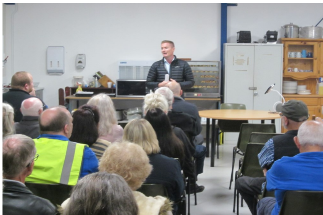
The Mayor Addressing the attendees