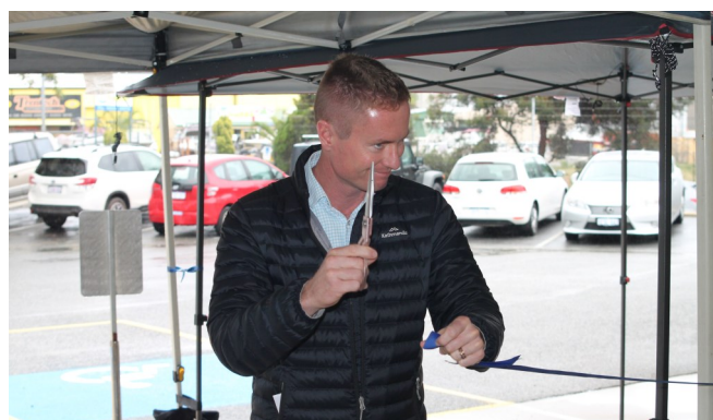
And to finish off with a little humour (I hope) "Did someone tell him not to enter the shed this way but to enter through the main door and sign the register"