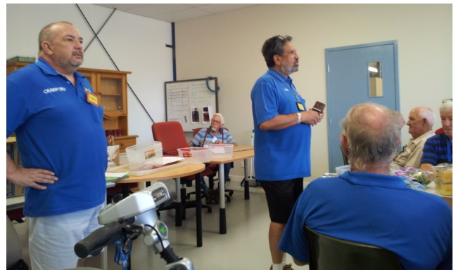
The first address to the members by President Reg in the new social room