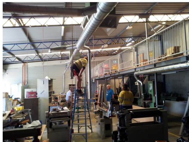
The dust extraction system being installed in the shed last week