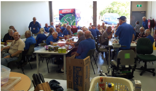
First Tuesday at the shed, it was probably a record attendance

You must register due to a state covid law that all people attending a venue must register on entry. Also that should there be an emergency incident or fire and evacuation of the building is necessary the register can help if any person has not evacuated.