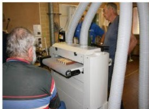
Figure 6. The new Hafco drum sander.