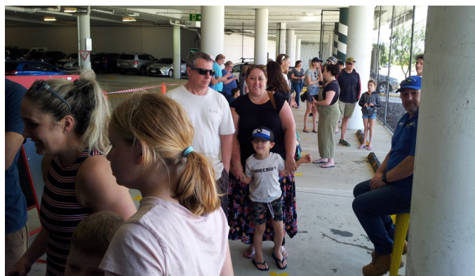
Our first Bunnings sausage sizzle since the Coved 19 cancellations was well attended by customers. The location of the sizzle has been moved from the entrance to the store to the underneath car park. There was concern that business would be slow being out of the main stream however concerns were allayed as we were flat out all day. The picture left shows the queue of customers waiting to be served.