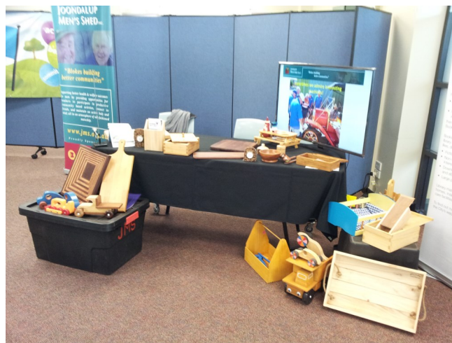
The stall at the Library displaying the sheds products, Barry compiled a rolling screen show of shed activities.