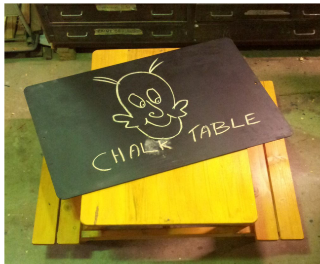
This is a new design for one of Franks picnic tables. The table has a removable chalk board on the top for children to draw. This design will be tested at the markets and if successful, more will be produced.