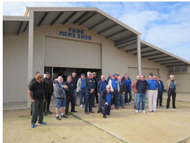
Farewell to the group from the Yorkers on the left before departing for lunch in the town.