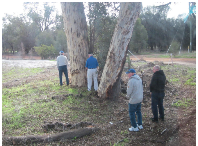
An emergency (P) stop on the way was required for those with not so strong bladders. Hope the trees survive the watering.