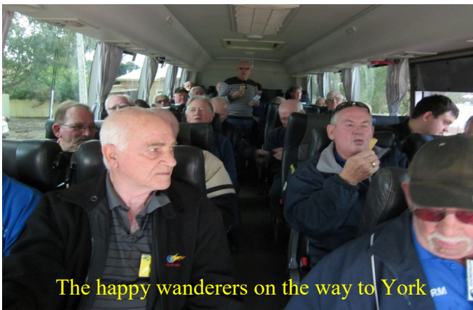
The happy wanderers on the way to York