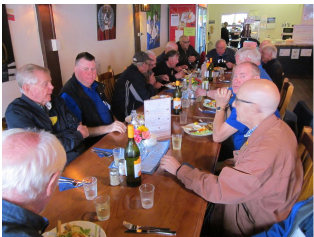
Lunch at the café in York