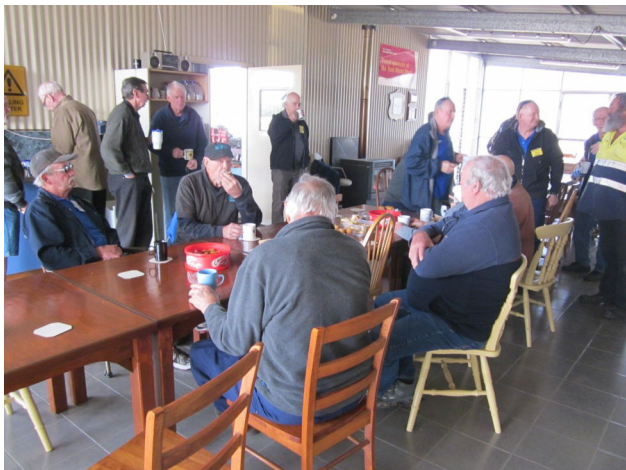
Enjoying a welcome morning tea in the meeting area