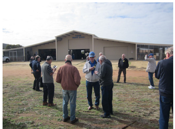
The York shed.