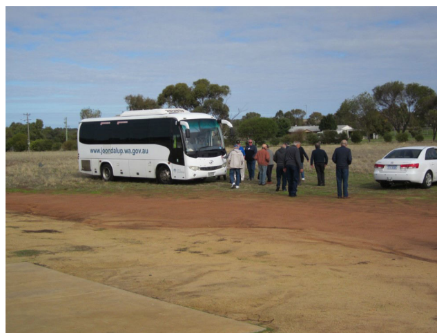
Heading to the bus for the trip home.