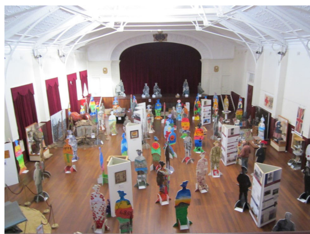
The Anzac exhibition in the historic York Town Hall