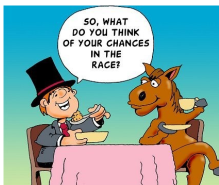
BREAKFAST WITH THE CHAMPIONS.

The few minutes that literally stops our Nation into an excited anticipation of predicting a winner and perhaps to share in a brief moment of euphoria. The JMS members requested a Cup celebration lunch, a yearly get together, a time to enjoy each others company, have bite to eat and relieve ourselves of some loose change or perhaps make a few dollars in predicting a winner. All a part of a successful luncheon and find any excuse to enjoy ourselves.